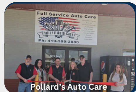
Pollard's Auto Care