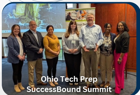
Ohio Tech Prep SuccessBound Summit