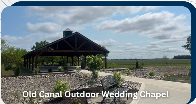
Old Canal Outdoor Wedding Chapel