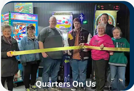
Quarters On Us