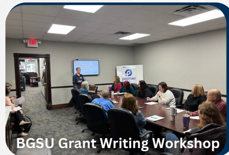
BGSU Grant Writing Workshop