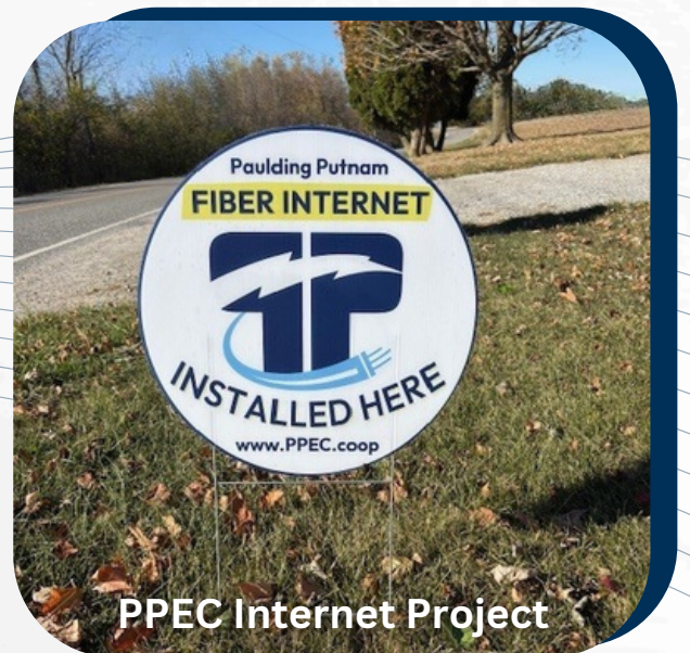
PPEC Internet Project