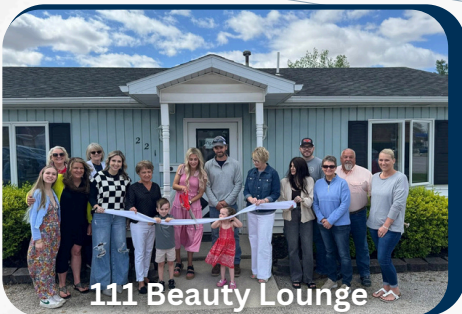
111 Beauty Lounge