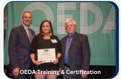
OEDA Training & Certification