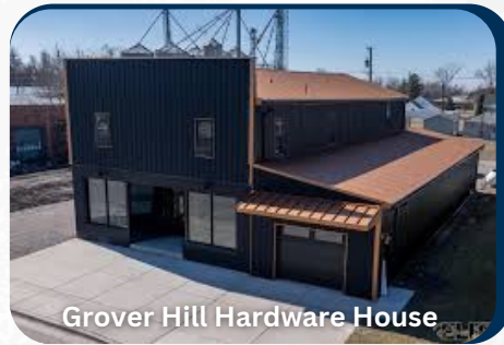
Grover Hill Hardware House