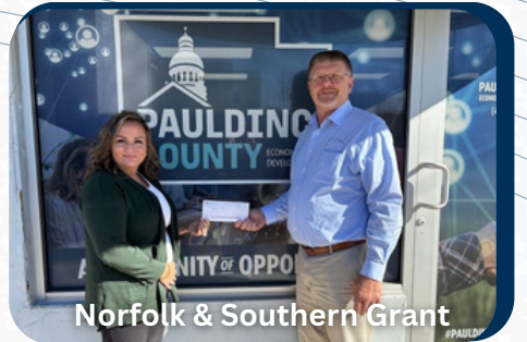
Norfolk & Southern Grant