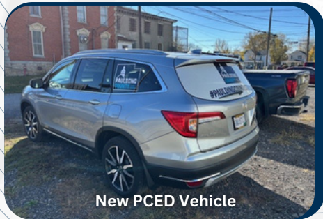
New PCED Vehicle