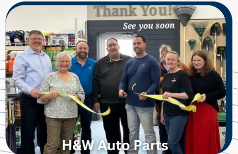
H&W Auto Parts