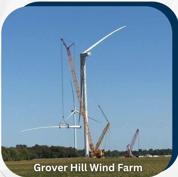
Grover Hill Wind Farm