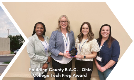
Paulding County B.A.C. - Ohio College Tech Prep Award