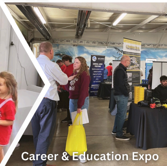
Career & Education Expo