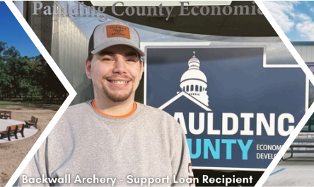
Backwall Archery - Support Loan Recipient