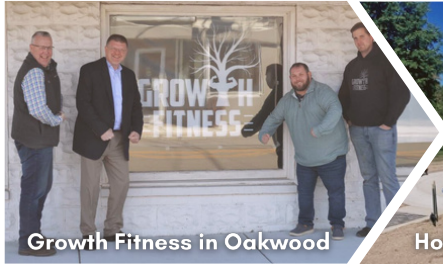
Growth Fitness in Oakwood