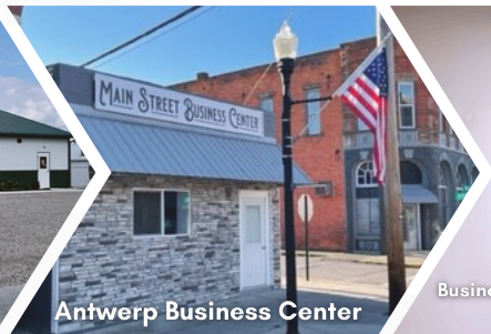
Antwerp Business Center