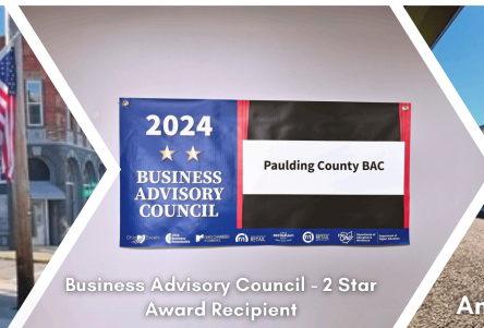
Business Advisory Council - 2 Star Award Recipient