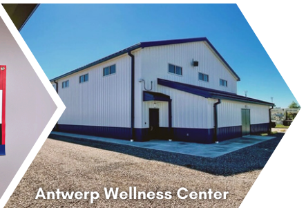
Antwerp Wellness Center

Paulding County Economic Development 101 E Perry St, Paulding, OH 45879 419-399-8282 www.pced.net