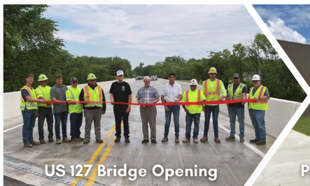
US 127 Bridge Opening