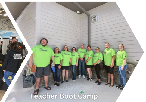
Teacher Boot Camp