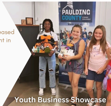
Youth Business Showcase