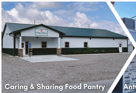
Caring & Sharing Food Pantry