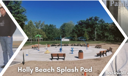
Holly Beach Splash Pad